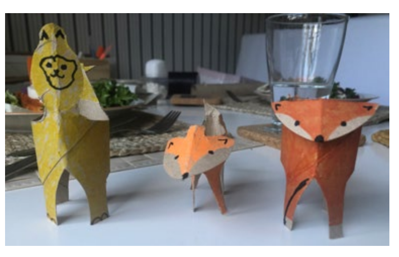
Craft animals.