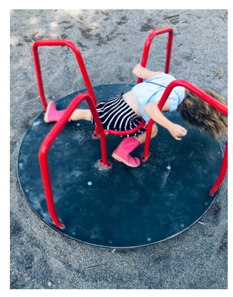
Child of a non-binary parent playing.