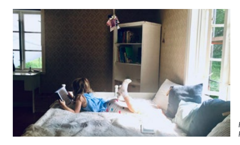
Reading in the sunshine.

"Trans parents are not on anyone's radar, we are invisible. And there is a clear expectation of trans people not being able to procreate. It makes me feel deeply angry at my country." – Benjamin, Germany