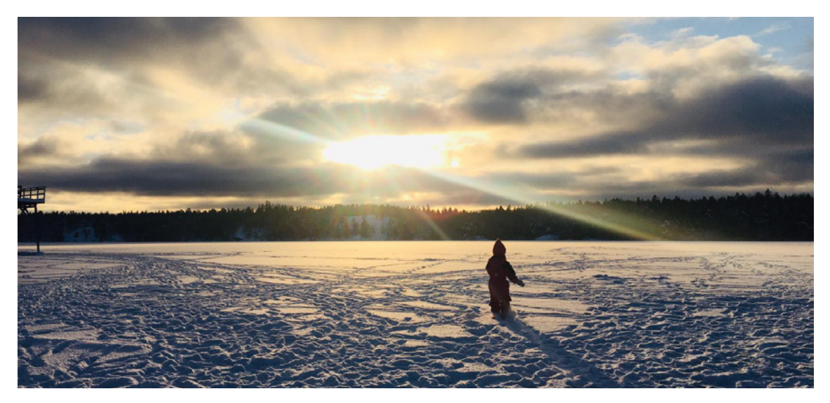
Child of a non-binary parent running across a field of snow.

7. Trans parents with residence in the EU who are third-country nationals encounter additional obstacles.