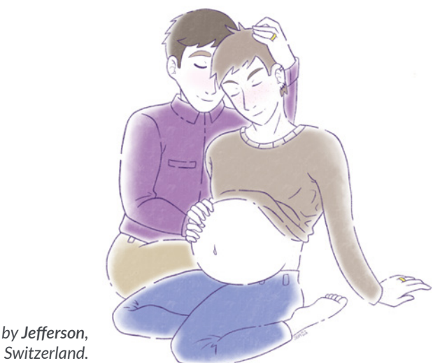
Illustration by Jefferson,