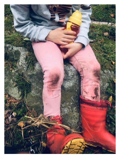
Sitting on a rock with dirty clothes.