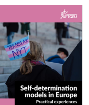
Self-determination in Europe. Practical Experiences

This report complements the first TGEU report on trans parenthood by discussing a variety of obstacles faced by trans parents in their daily lives that go beyond issues relating to freedom of movement.