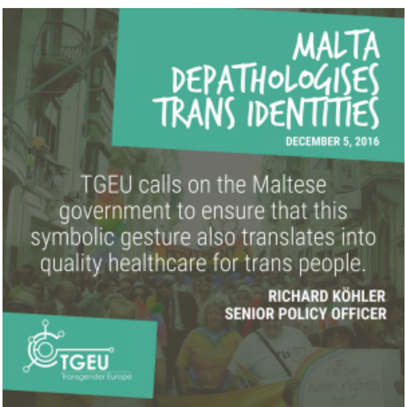
Timeline of Malta's protection of trans rights